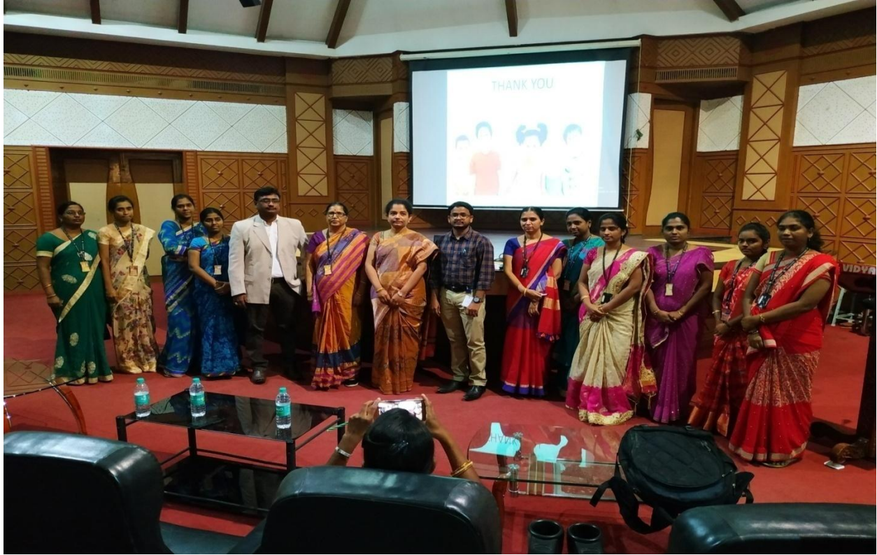
The programme adjourned with National Anthem